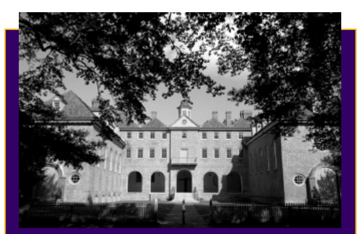
The Wren Building at William and Mary in Williamsburg, Virginia is the birthplace of Phi Beta Kappa. This historic site marks the beginning of the American college fraternity system.

College fraternities are groups of young men and women who are banded together. Phi Beta Kappa had all the characteristics of the modern fraternity, the charm and mystery of secrecy, a ritual, oaths of fidelity, a grip, a motto, a badge, a background of high idealism, a strong tie of friendship and comradeship, and an urge for showing its values through nationwide expansion. While an individual has an opportunity to join various organizations, membership selection and acceptance are based on mutually shared values.