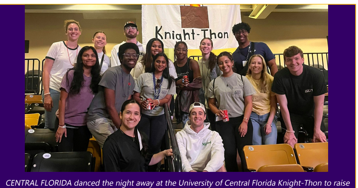
CENTRAL FLORIDA danced the night away at the University of Central Florida Knight-Thon to raise funds and awareness for the Orlando Health Arnold Palmer Children's Hospital.

The <u>Chapter Advisor</u> is an individual, elected by each collegiate chapter and reported to the Central Office willing to serve as an institutional resource for the chapter. The Chapter Advisor must be a member of the school's faculty or administration. Chapter Advisors who are not members of the Fraternity may not participate in Ritual portions of Fraternity activities.