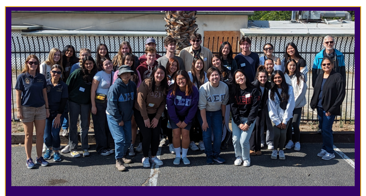
For Make a Difference Day, 45 brothers, potential new members and guests from CALIFORNIA-IRVINE, CHAPMAN (CA), PEPPERDINE (CA), ORANGE COUNTY (CA) and INLAND EMPIRE (CA) participated in the service activities for Santa Claus, Inc.

There are several things to consider when planning an event. This grid on the following page will assist you in event planning. Also use the "Guide for Planning Meetings and Events" on dsp.org as an additional resource for things to consider, by visiting this link .