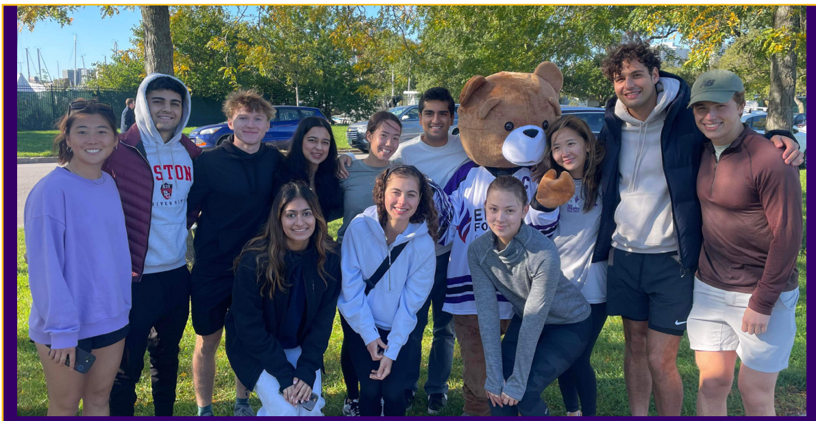
CHICAGO participated in the Epilepsy Foundation of Greater Chicago's 5K Fall Fest Walk. The brothers bonded together while raising donations to support ongoing research and treatments.