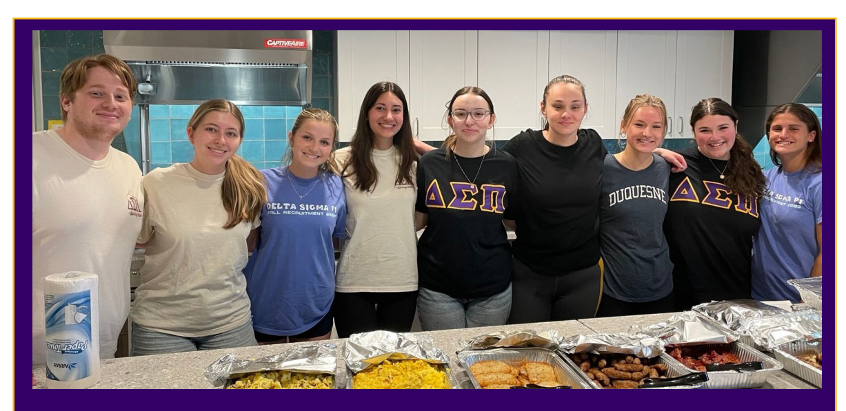
Delta Sigma Pi chapters prioritize service by hosting events on their campuses and in their communities. DUQUESNE (PA) volunteered at Family House in Pittsburgh to provide breakfast for families staying at the lodging location.

We urge you to make the most of this manual, as the more you know about Delta Sigma Pi and its place in the business world, the more you will appreciate the value of membership. We also encourage you to reach beyond the limited area of this manual for other facts about Delta Sigma Pi – interact with Deltasig alumni and visit the website at dsp.org . You will be rewarded for this effort through the increased pride you will have in your membership.