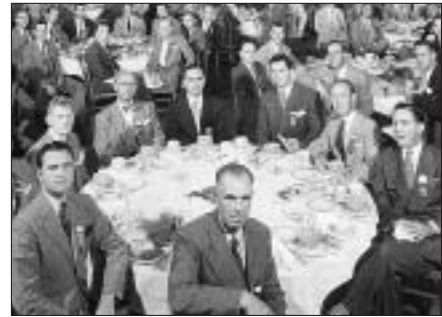
1947 Grand Chapter Congress, Minneapolis.