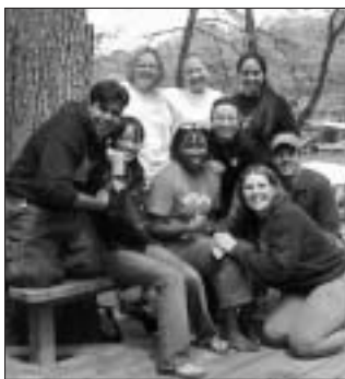
TRUMAN STATE brothers celebrate their Rose Formal at Lake of the Ozarks. Throughout the semester, the chapter bonded at various brotherhood events including board game night, ice cream parties, bowling, and their 13th Annual 5K Walk/Run for Cystic Fibrosis.