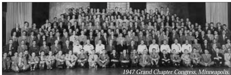
1947 Grand Chapter Congress, Minneapolis.