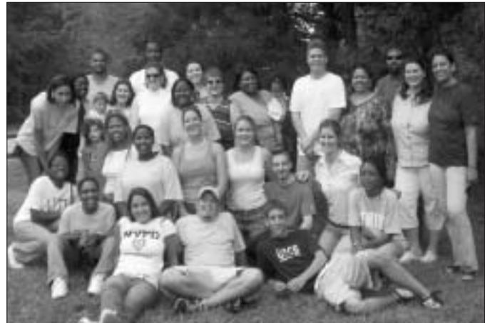
NORTH CAROLINA-GREENSBORO brothers celebrate National Alumni Day by putting together a picnic for local alumni.

the chapter has agreed to make Habitat for Humanity a regular community service event.