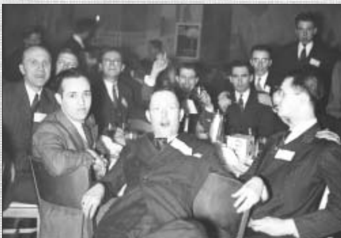
Northwestern-Chicago brothers clown around during a meal at convention.