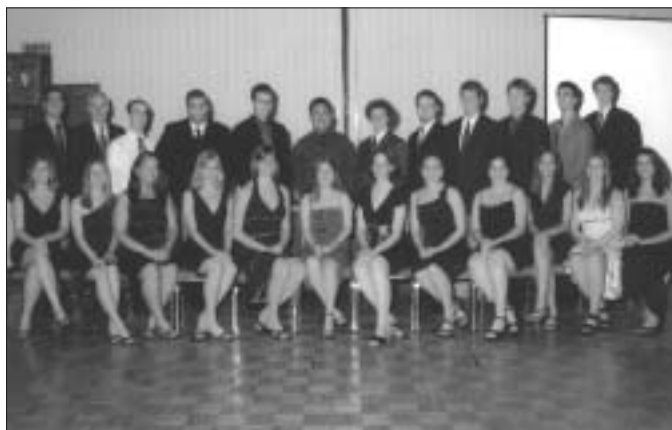
April 17 was a milestone day for Delta Sigma Pi as Beta Sigma Chapter at ST. LOUIS was reactivated with the support of two new faculty initiates, scores of Beta Sigma alumni and members of the St. Louis Alumni Chapter.