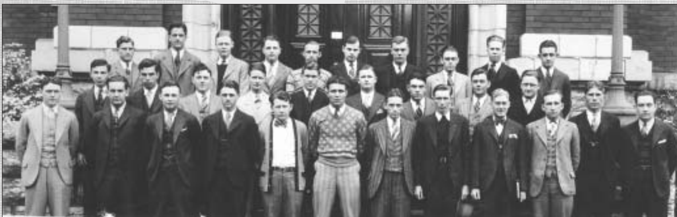
Recognize any of these Kentucky brothers?