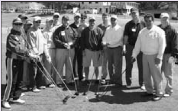
Thank you to all the golfers who participated in the ATLANTA Alumni Chapter Golf Tournament benefiting the Leadership Foundation.

opportunities for alumni chapters to share their activities and events with brothers across the country. Does your chapter have something to share? See the contents page for details on where to send your articles and pictures.