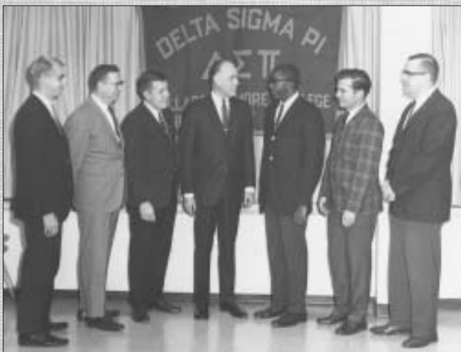
Brothers from Alpha Kappa at Buffalo kept each other in line.