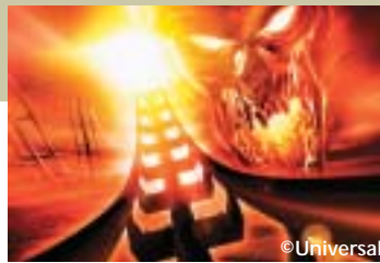
The Incredible Hulk Coaster