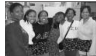
Brothers from WAYNE STATE-MICHIGAN are all smiles while volunteering at a local Detroit area soup kitchen.