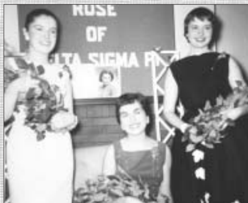
Deltasig Roses from Marquette.