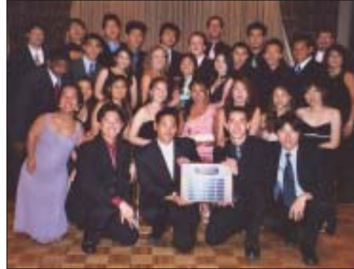
CALIFORNIA-SAN DIEGO brothers proudly display their Scholarship Key plaque.

hosting a Halloween party for an elementary school.