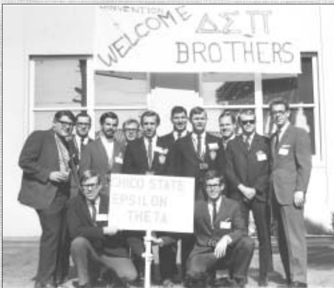
Cal State-Chico brothers send delegates to the Western Regional Convention.