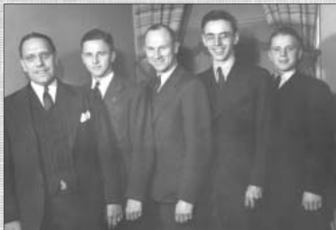
Detroit brothers share a moment of brotherhood.