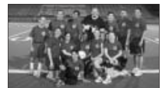
TEXAS-ARLINGTON brothers, celebrate the end of another intramural game.