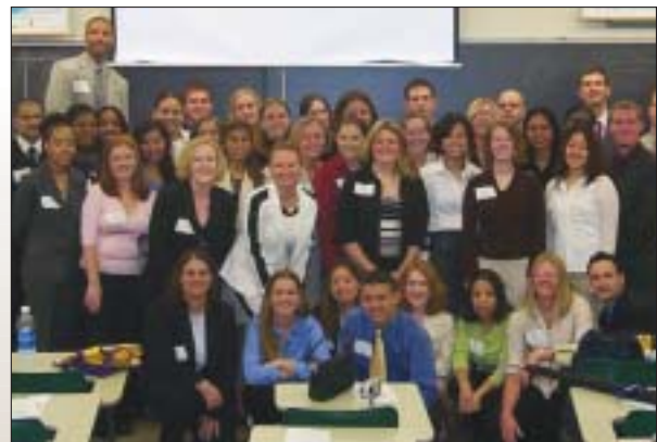
TOP: FLORIDA INTERNATIONAL brothers take time out for a picture after becoming the newest members of Delta Sigma Pi on February 21. ABOVE LEFT: CORNELL brothers are all smiles during one of their first group photos together. ABOVE RIGHT: New RADFORD brothers celebrate the granting of their charter, March 27.

the largest with over 32,000 students. The College of Business Administration, department of economics, and School of Hospitality management enroll over 4,000 students eligible for consideration in the Fraternity.