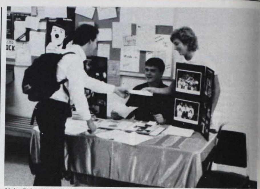
Alpha Delta Chapter at the University of Nebraska at Lincoln has been successful in its recruiting efforts during the past several years through the use of the information table.

THETA TAU-Theta Tau Chapter's 14th Annual Spring Break Trip to Daytona, Florida, (run exclusively by Theta Tau Chapter), was another successful expe-