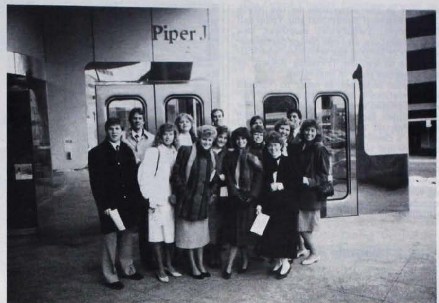
The Piper Jaffray Tower in Minneapolis was one of several tours conducted this year by Epsilon Chapter at the University of Iowa.

To celebrate the holiday season the Brothers sponsored a Christmas Party for the entire business faculty giving us a chance to meet them in a social atmosphere. We felt that the party was necessary