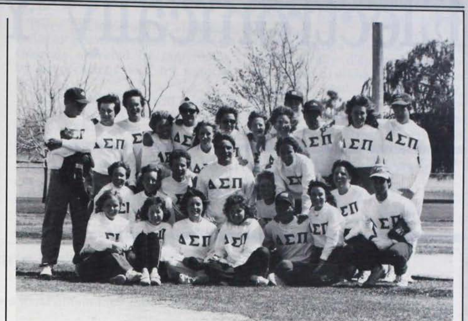
Beta Upsilon Chapter's pledges celebrated after the Pledge/Brother Softball Game at Texas Tech University.

IOTA PSI-Iota Psi Chapter is a small, but very effective chapter. The fall semester's highlights included fund raisers that single-handedly financed our community service projects that were extremely re-