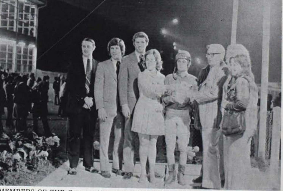
MEMBERS OF THE Crescent City Alumni Club in New Orleans are shown here during a recent trip to the Fairgrounds Race Track in New Orleans.