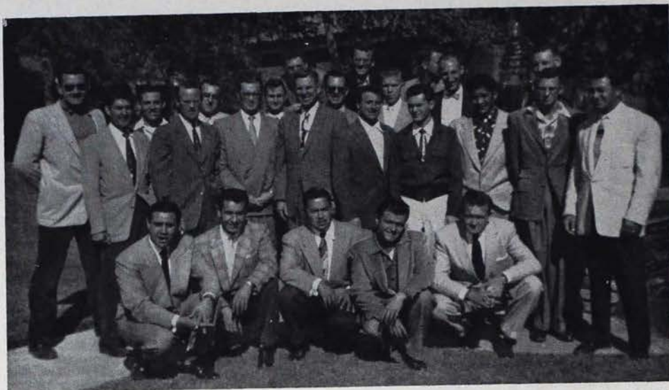
FIELD TRIP taken by Gamma Phi Chapter at Texas Western to the Standard Oil Company in El Paso, showing the actives, pledges and chapter advisor who participated.

Socially, our Christmas party was, as usual, the highlight of the winter social season. Late in January, an alumni stag party was held at the chapter house with the active chapter