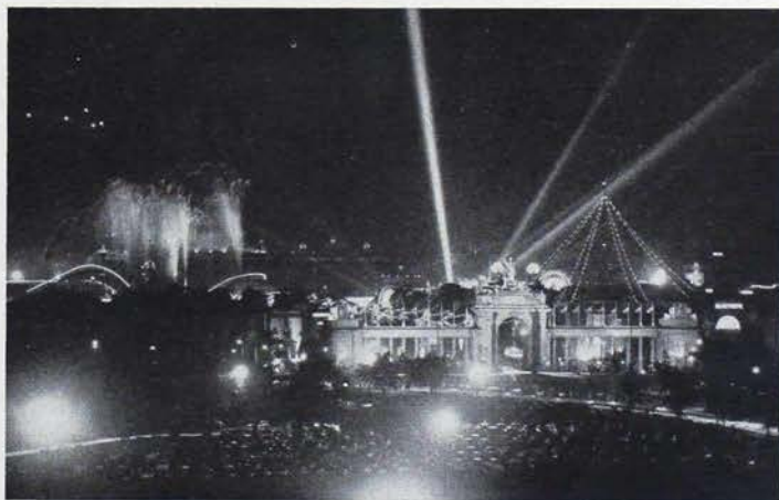
THE DAZZLING lights of the Canadian National Exhibition illuminate the world's largest annual industrial and agricultural fair. The scene is Toronto, six hours from Detroit.

But no matter how you get here, whether by train, plane, boat, car, walking, running or pony express, Detroit won't be topped for years to come! Plan your vacation now around the dates August 31, September 1, 2 and 3, and be sure to send in your advance registrations early. We already have some. FIRST COME—FIRST SERVED.