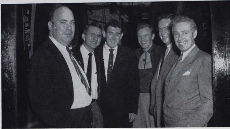
MEMBERS, ALUMNI, AND PLEDGES of Alpha Theta Chapter at the University of Cincinnati, on a tour of Meiers Wine Cellars, Silverton, Ohio.