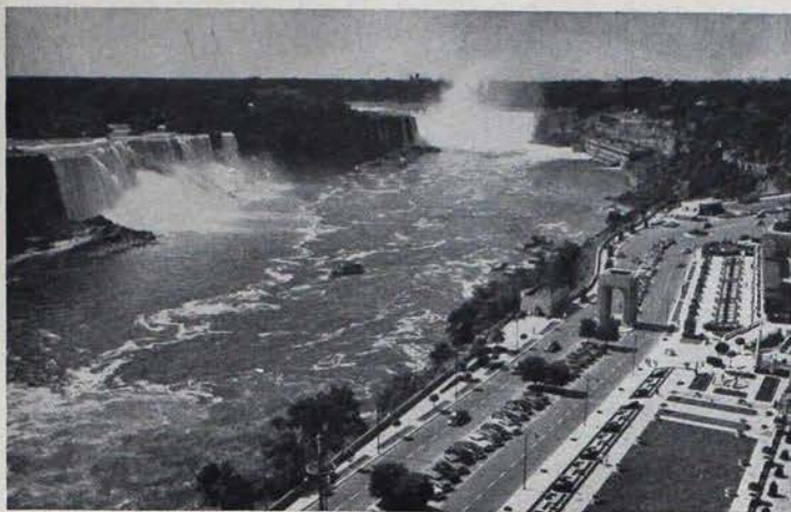
ALMOST NO NEED TO NAME the world's No. 1 tourist attraction, Niagara Falls, just an afternoon's drive from the convention city. This is the view from the Canadian side.

low for an estimated attendance! Well fella's we're really happy to hear that so many are really going to come this year. We are also elated to hear that many groups are planning the trip. That's wonderful! It not only saves travelling expenses but it's much more fun too!