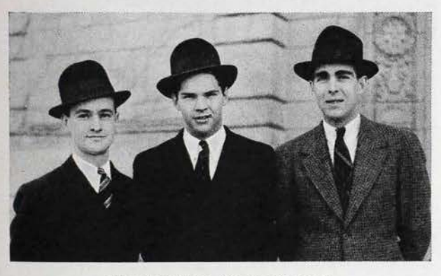
PROMINENT ON KANSAS CAMPUS

Always progressive, always ready to grasp a good idea, lota chapter held an industrial tour to Kansas City in lieu