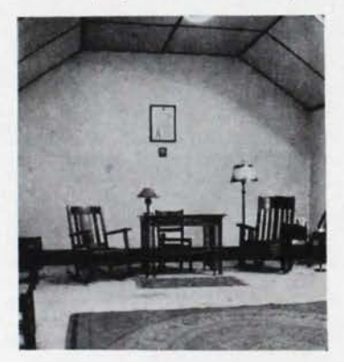
A VIEW OF THE QUARTERS OF OUR PI CHAPTER AT THE UNIVERSITY OF GEORGIA, ATHENS, GEORGIA

We succeeded in electing all of the officers of the Economic Society recently,