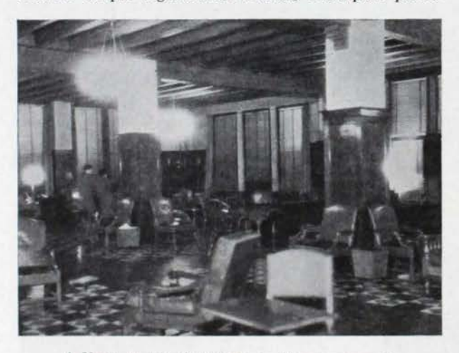
A VIEW OF THE QUARTERS OF NORTHWESTERN'S COMMERCE CLUB

And when the School of Commerce of Northwestern University built its $1,000,000 building on Chicago Avenue, 12 years ago, the Commerce Club was alloted 4400 square feet of space on the third floor for use as a club room. The club spent some $15,000 in equipping this room which is one of the most beautiful club rooms in the city of Chicago and is quite popular and used extensively by the students before and after classes. The Commerce Club is not just another campus organization. It offers a complete profes-