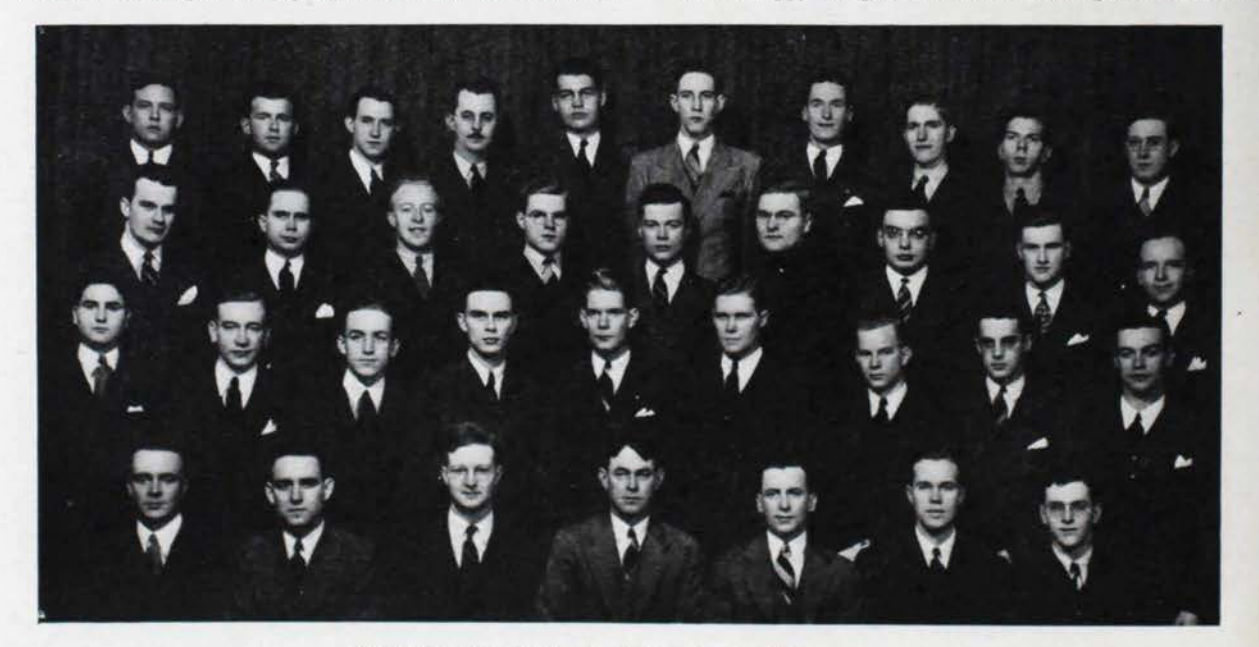
MEMBERS OF XI CHAPTER, UNIVERSITY OF MICHIGAN

We are happy to report no casualties among our members