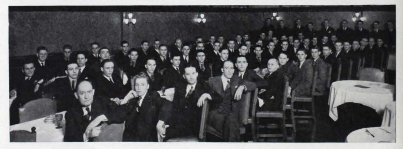
OUR COLORADO AND DENVER CHAPTERS HOLD JOINT BANQUET IN DENVER