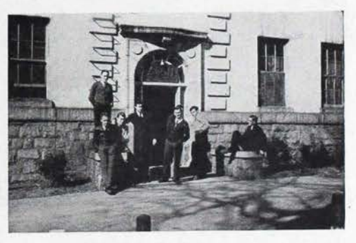
ENTRANCE TO OUR SOUTH CAROLINA CHAPTER HOUSE

Yes, prosperity is just around the corner, for Psi Chapter has turned that corner and can see prosperity straight ahead.—HOWARD OLMSTED