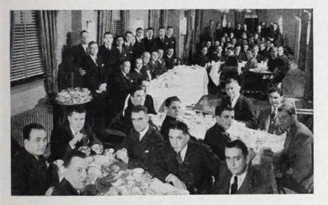
JOINT INITIATION BANQUET HELD BY THETA AND XI CHAPTERS Detroit, Mich., December 4, 1937

to get acquainted with each other, to become acquainted with the friends of their sons, and to know more about Delta Sigma Pi. The brothers put on a skit impersonating a pledge class, outlining the purposes of Delta Sigma Pi and its methods of pledge training. Cards followed and light