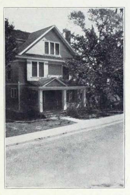
Iota Chapter House

Iota has had two smokers this year, one on September 17 and the second, October 4. Another planned for soon after the beginning of the second semester. In addition to these, Iota held a joint smoker with the local chapter of Alpha Kappa Psi,