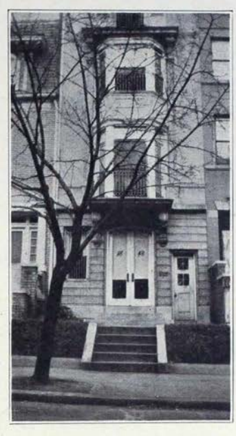
Mu Chapter House

The registration in the School of Foreign Service is around the 450 mark, and the incoming freshman class contained a wealth of good material. Several smokers have been held, with the result that fourteen men have been